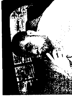
Event # 9729 11/14/2014 @ 01:47:07 PM Initial Test Failed 0.036 g/210L

Questions or Problems ??? For Report Assistance Please Call (866) 385-5900