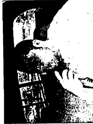
Event # 9713 11/14/2014 @ 01:33:08 PM Initial Test Failed 0.037 g/210L