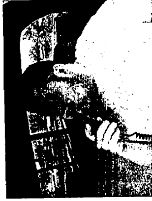
Event # 9695 11/14/2014 @ 12:55:26 PM Initial Test Failed High BrAC 0.041 g/210L