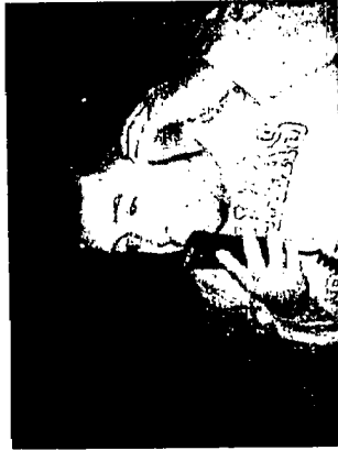
Event # 9676 11/13/2014 @ 08:14:57 PM Initial Test Passed 0 g/210L