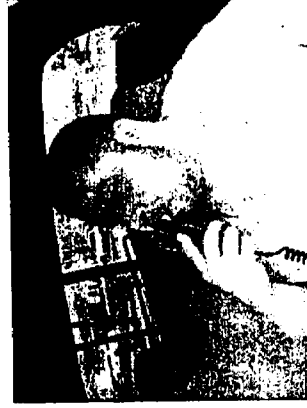
Event # 9720 11/14/2014 @ 01:40:44 PM Initial Test Failed 0.036 g/210L