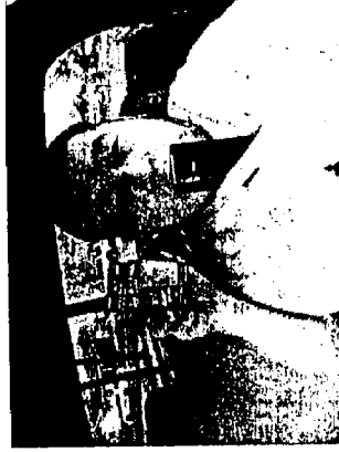
Event # 9704 11/14/2014 @ 01:03:09 PM Initial Test Failed High BrAC 0.044 g/210L